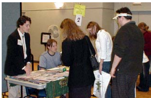
Students gather information from recruiters

Surveys taken by both students and employers indicate positive results and comments. Students were impressed with the organization of the Fair and employer responsiveness.