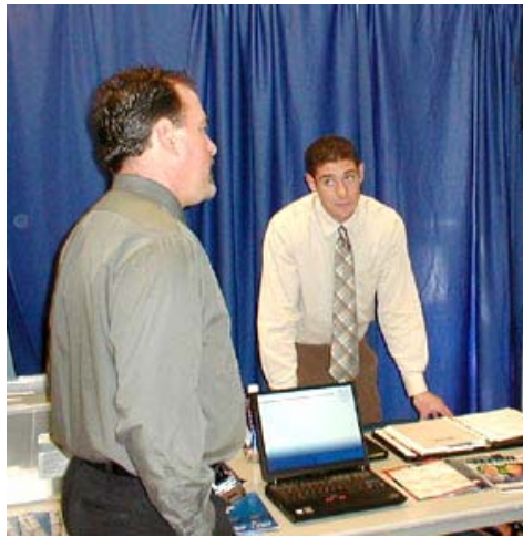
Recruiters discussing internship opportunities

On Tuesday, October 28 th , Bridgewater State College hosted its Third Annual Internship Fair. The Fair was a huge success, with over twenty employers providing information on many different fields of interest. Over 200 students participated in this year's fair, contributing to the over all success.