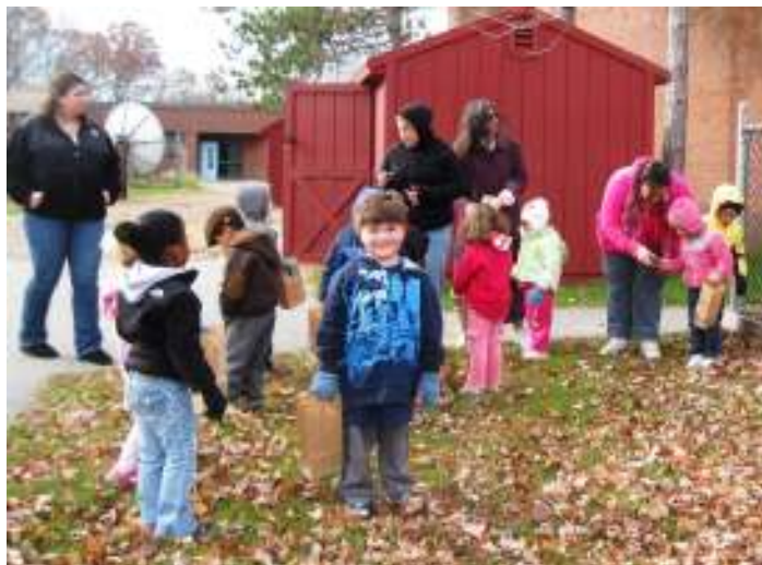
Nature Walk - November 3, 2010