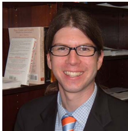
Professor Ben Carson

"It doesn't look like Mordor," I thought upon approaching Birmingham, England on August 10, 2005. I was heading to Tolkien 2005, the conference commemorating the 50 th anniversary of the publication of Tolkien's The Return of the King . And I wondered if the committee had even considered that the city of Tolkien's youth, in its industrial heyday, had made such an impression on young Tolkien's mind that it became the model for his land of polluting evil. I had to think of something other than the fact I was presenting at my first conference in three days.