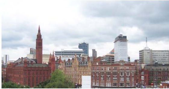
Birmingham from my window

the time being, I flipped through the rest of the programme (spelled with an e, in true British fashion) before getting up to wander the Aston vicinity (wondering, among other things, why everything was named Vauxhall and why the Dentists had their own reserved parking spaces).