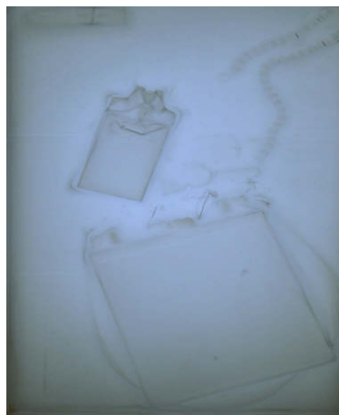
Merav Ezer, Vacuum Memories , #1, #2, #3, Mixed Media, Overview, 2004.