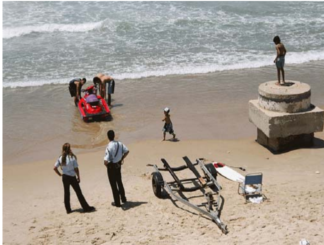
Western Beach #3