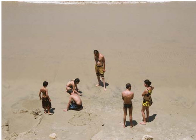
Western Beach #4