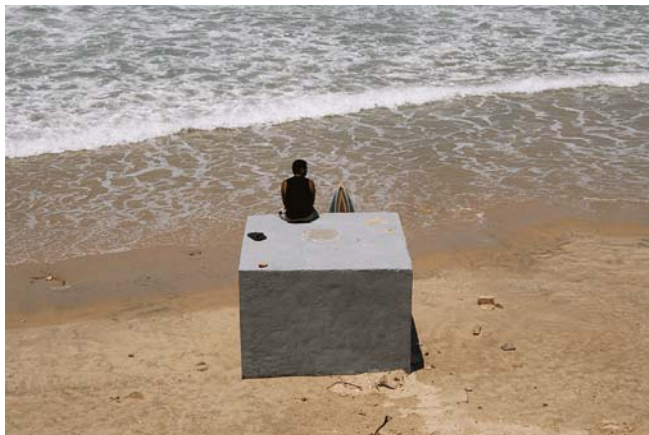
Western Beach #2