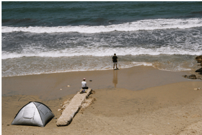
Western Beach #1

The scene depicted in the third photograph evokes motifs of the law, crime, and innocence. This scene documents, perhaps, an attempted illegal border crossing. Two police officers, a male and a female, ostensibly protect the seashore from invasion or other danger. Both officers represent authority and the disciplining power of the state; their individual gender does not matter, as it is subsumed by the authority bestowed upon them.