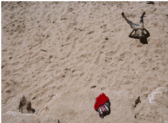
Western Beach #5

Western Beach, Yahezkel Lazarov, Photograph series #1 - #5, Prints 16" x 20," 2004.