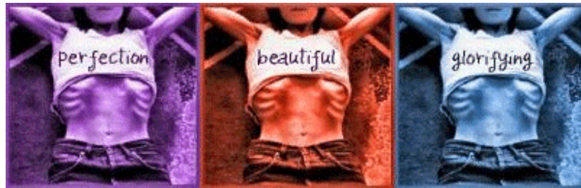
Figure 3 - Homepage of a pro-anorexia website.

Most sites make it quite clear that their purpose is to support those who are struggling with an eating disorder, and to provide a space, free from judgment, where they can share ideas and offer encouragement to those who are not yet ready to recover. Some of the homepages of these websites display images of emaciated and skeletal bodies (Figure 3).