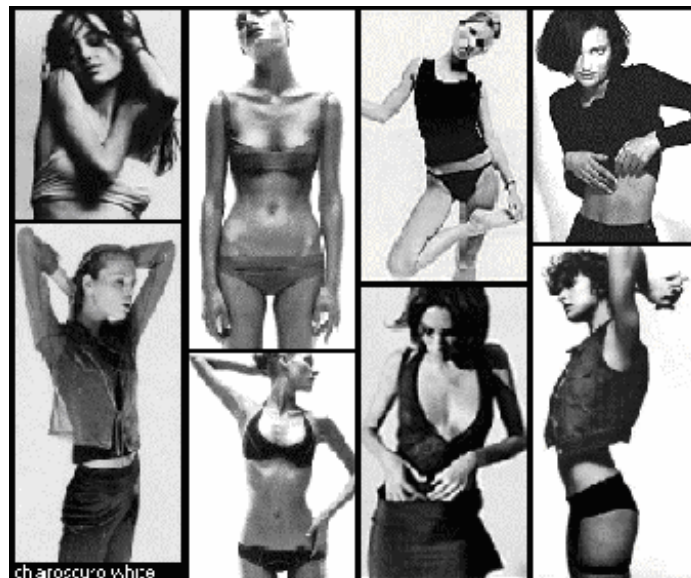
Figure 4 - A collage of mainstream images of celebrities and fashion models.

The primary purpose of these sites seems, on first contact, to promote and support anorexia, including detailed “how to” sections. These sites tend to have common features such as: bulletin boards and chat rooms; diaries (website owners post their diaries online, often keeping viewers up-to-date daily on calorie intake or avoidance, relapses, recommitments, etc. ); tips and tricks ( e.g. ideas for dieting, food avoidance, distractions from hunger, etc. ); trigger pictures or thinspirations (pictures of ultra-thin, emaciated bodies to inspire loyalty to the regime and distractions from hunger); and, links to other pro-ana sites, often in the form of web-rings. ix Some also have poetry, lyrics, stories, treatment information and general information about anorexia, and related issues.