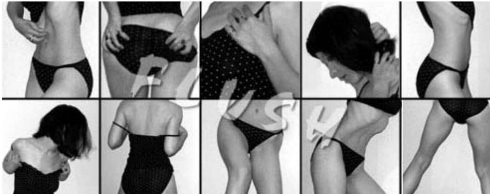
Figure 5 - A collage of images allegedly created as a self-portrait of the website owner.

mimic themes commonly found in advertising, such as dismemberment, where bodies are hacked apart, and certain body parts are focused upon (Figure 5).