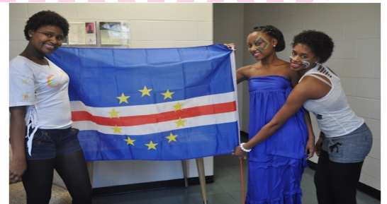
First Fridays of Service