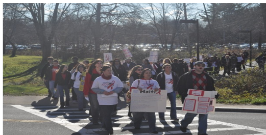
World AIDS Day