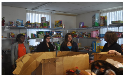
Gift of Giving