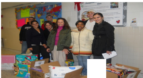
Baskets of Love