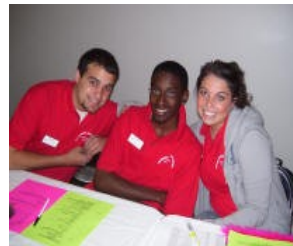
Learning Leadership as an Orientation Leader

One of BSC's signature programs is called the Leadership