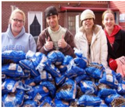
Learning Leadership through service

“Just like students gain career skills through internships, a student can gain significant leadership skills through gaining experience leading their peers.”