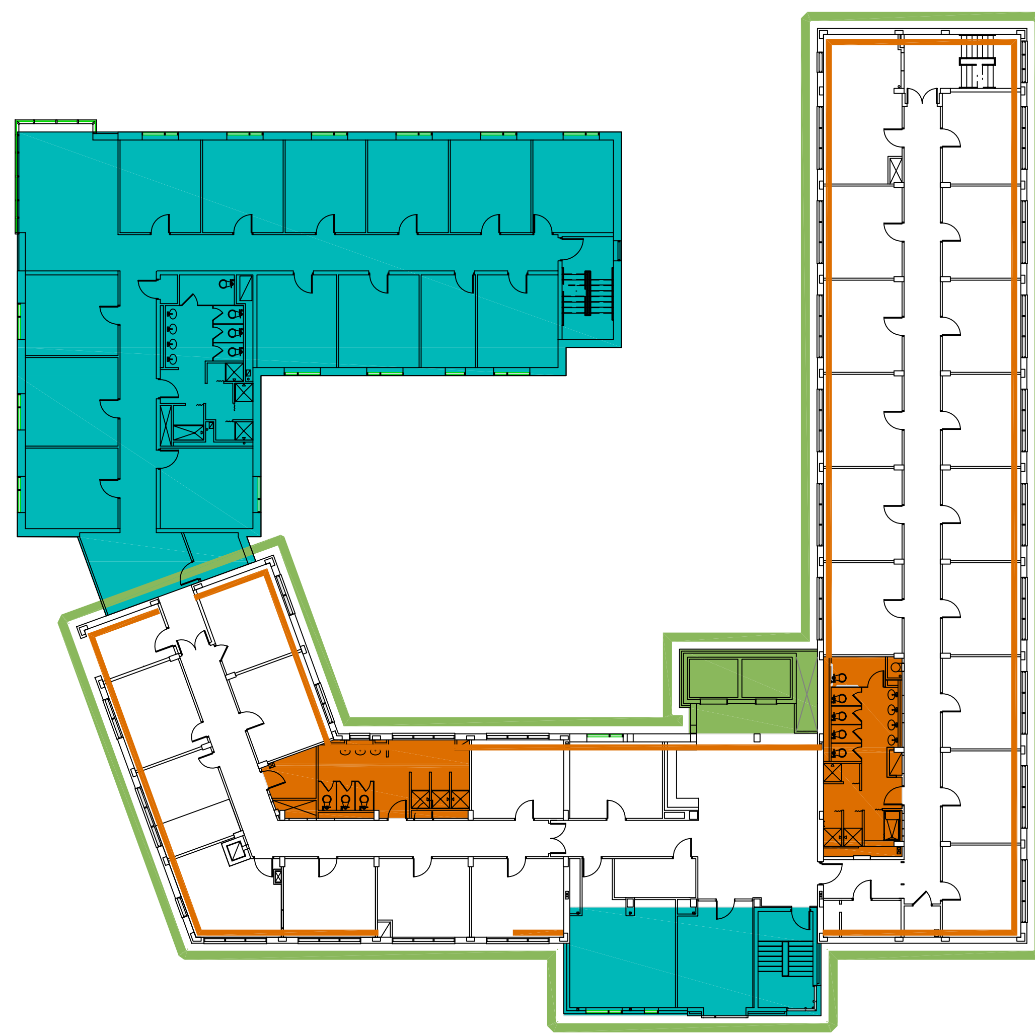
TYPICAL FLOOR 2-3