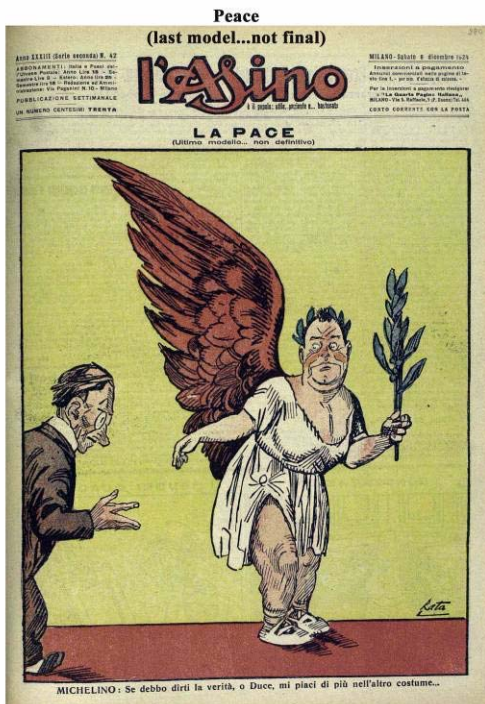
MICHELINO: Se debbo dirti la verità, o Duce, mi piace di più nell'altro costume... Michelino: If I have to tell you the truth, oh Duce, I like you more with the other dress...

The next model I will examine is related to the feminine features that cartoonists tend to use in order to mock Mussolini and his functionaries.