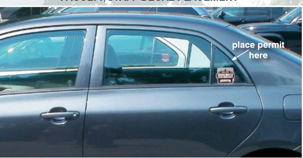
STUDENT DECAL PLACEMENT

my.bridgew.edu/student-life/safety-on-campus